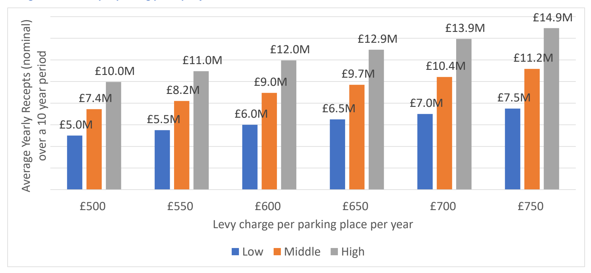
Figure 3: High, Medium and Low modelled Scenarios for the Average Yearly Receipts from an Edinburgh WPL over 10 years by charge level values per parking place per year.